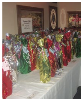
The CMH Foundation's 9th Annual Wine and Beer Tasting Event raised $9,400.

Register by calling 878-7026 | $20 registration fee