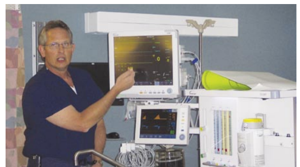
A company representative explains how the new anesthesia equipment works. The machine, which warms breathing circuits and has state of the art ventilation modes, was purchased with funds donated by the CMH Foundation.